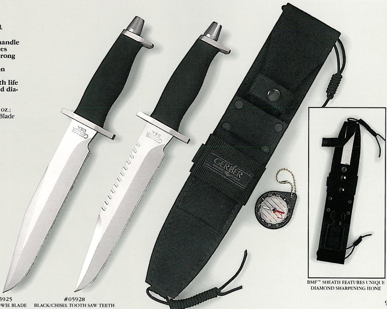
#05925 BLACK/BOWIE BLADE