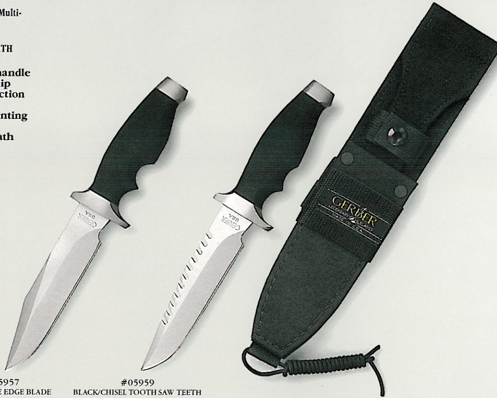
#05957 BLACK/FALSE EDGE BLADE